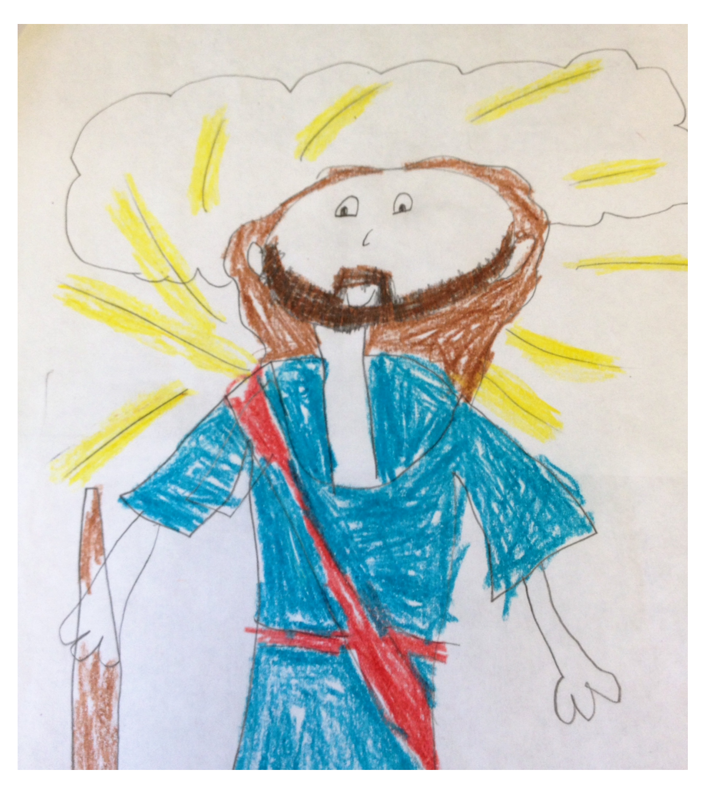
The beauty of Jesus